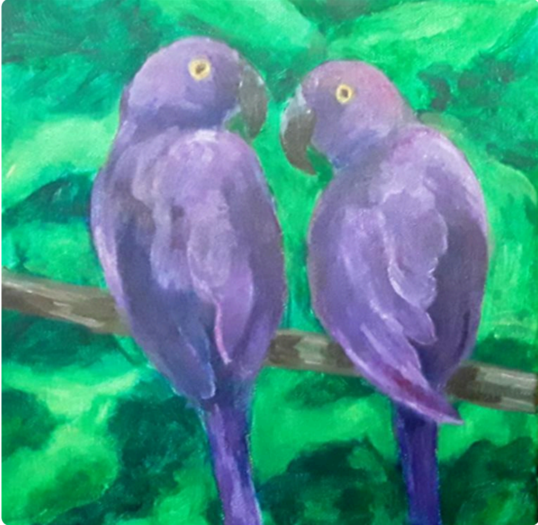
Parrots for Teressea